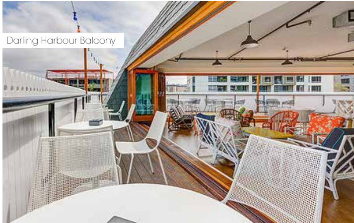
Darling Harbour Balcony